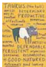
TAURUS (Apr 22-May 20)

'Seven of Cups' says you may have everything you need but there may be a black swirl around you due to which you cannot see the access things. You need to be more open and notice your surroundings and start taking advantages of your surroundings and see the colours of vibration around you.