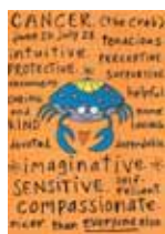
CANCER (June 22-July 22)

'Knight of Swords' says that, you will be gaining intellect and knowledge. You will want to reach your destination as soon as possible so you're working very fast. You will be energetic but you need to be cautious and careful about the decisions you take.