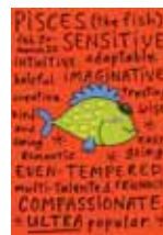
PISCES (Feb 22-Mar 21)

In the month of June, 'Five of Wands' brings in competition and more hard work so as to accomplish which may be difficult but not impossible. You need to take up the challenge and face it with determination so that you get to prove yourself in front of others.