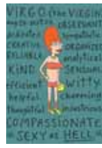
VIRGO (Aug 23-Sep 22)

'Four of Pentacles' says that there is money and prosperity this month. It also indicates that you will be very calculative and evaluating each aspect of the situations. You have to come out of the grid so that positive work takes place. One should not always be disciplined in life rather enjoy the fruits of the hard work done.