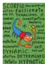
SCORPIO (May 22-Nov 21)

'Three of Cups' says that this month brings in good news, happiness, blessings satisfaction and positive hope. You will enjoy the month of June.