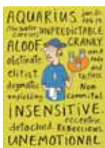
AQUARIUS (Jan 22-Feb 21)

'Page of Wands' says that in the month of July, you all will be very energetic and enthusiastic. You are very well focused and moving fast towards your destination. You will have to take care of the steps you follow by taking guidance and help from your elders. New projects in this month can be initiated.