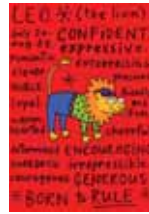
LEO (July 23-Aug 22)

In the month of June, you will take up all the work and responsibilities at a time. This is the time when you need to set your tasks and take-up one by one, otherwise, it will lead to mental tension and health problems.