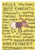
ARIES (Mar 21-Apr 19)

'Seven of Cups' says you may have everything you need but there may be a black swirl around you due to which you cannot see the access things. You need to be more open and notice your surroundings and start taking advantages of your surroundings and see the colours of vibration around you.