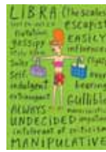
LIBRA (Sep 23-Oct 22)

'The Queen of Wands' says that you will be career oriented this month. You are ready to achieve your targets. You are holding a position and status like the queen. You will be able to influence others without getting affected by their behaviour.