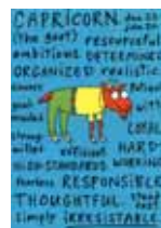
CAPRICORN (Dec 22-Jan 21)

'Nine of Pentacles' says you will enjoy a very high position and status. You are likely to get the desired results and the work of your interest. You will be surrounded with happiness and satisfaction at personal and professional level. This is going to be a very lucky month for all of you.