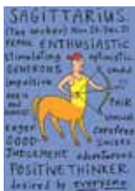
SAGITTARIUS (Nov 22-Dec 21)

You will earn good name and fame according to 'Nine of Pentacles'. You will have freedom for your decisions and money. You will enjoy sudden prosperity. You may even earn a lottery. You will be very confident about your achievements and this will increase your self-confidence.