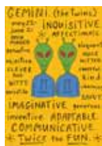
GEMINI (May 21-June 21)

'Queen of Cups' says the doubt continues this month too. The doubt may arise with your environment. Don't listen to others, instead you have confidence so move ahead and step forward.